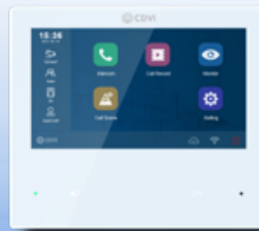
IP-MONSQ IP Monitor White - Square