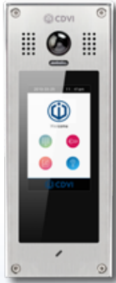
IP-MDS Multi-Door IP Station