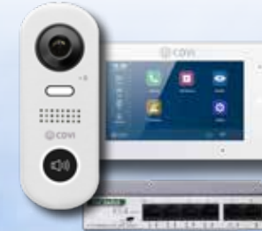
IP-KIT IP Intercom Kit